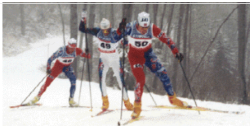
1) Poling side with excellent upper body compression and weight shift.

Home News & Features XC Ski Events Training & Technique Equipment Ski Here Family AXCS