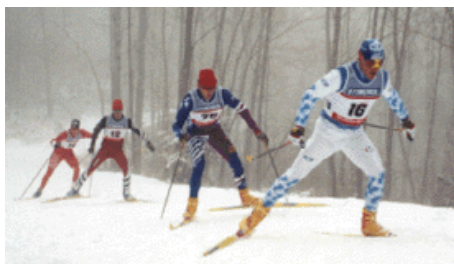
3) Superior weight transfer onto the glide side.