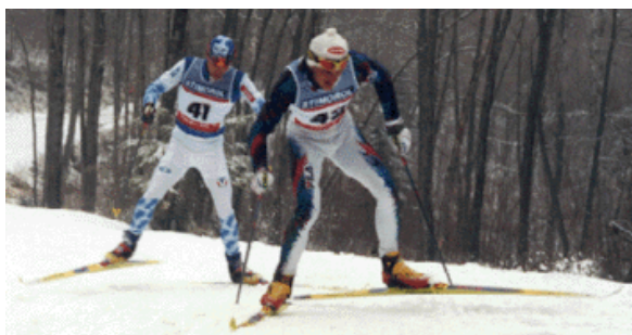
2) Lateral weight transfer with continuation of the poling motion.